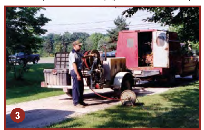
Following pumping and cleaning of all system tanks, jet and vacuum all absorption field lines.