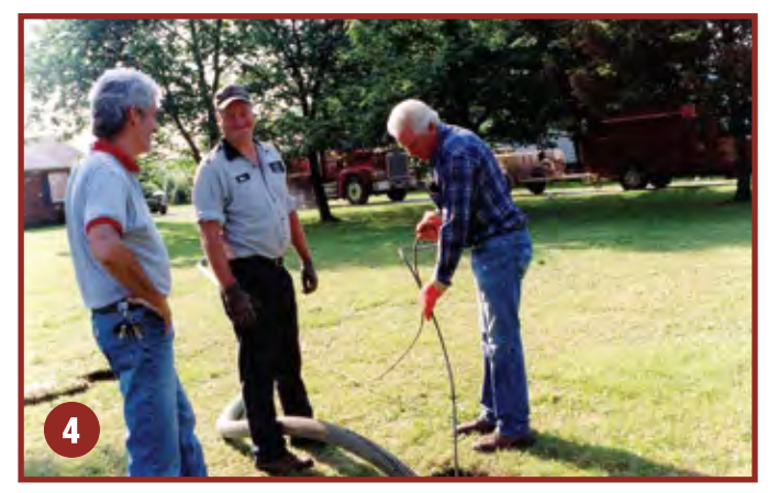
System jetting will remove trash, line deposits, and bio films, and allow adequate distribution of the bio-remediation treatment to the absorption system.