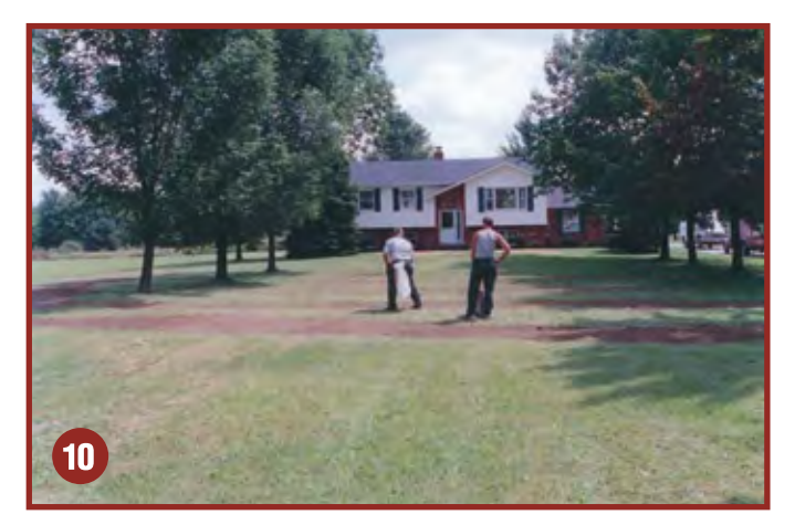
On completion of the bio-remediation process, check the field grade and fill any low spots where the absorption filled lines run. This will eliminate unnecessary water collection above and within the absorption area. Your customers will love the technology, results and cost savings!