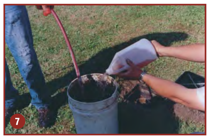
Blend each PRO-PUMP material with tap water prior to addition to the system.

Be sure to inspect all connecting junction box locations (level, repair and adjust distribution flow), then jet junction boxes and drop boxes (to achieve adequate flow and distribution of materials during remediation, and following the treatment process).